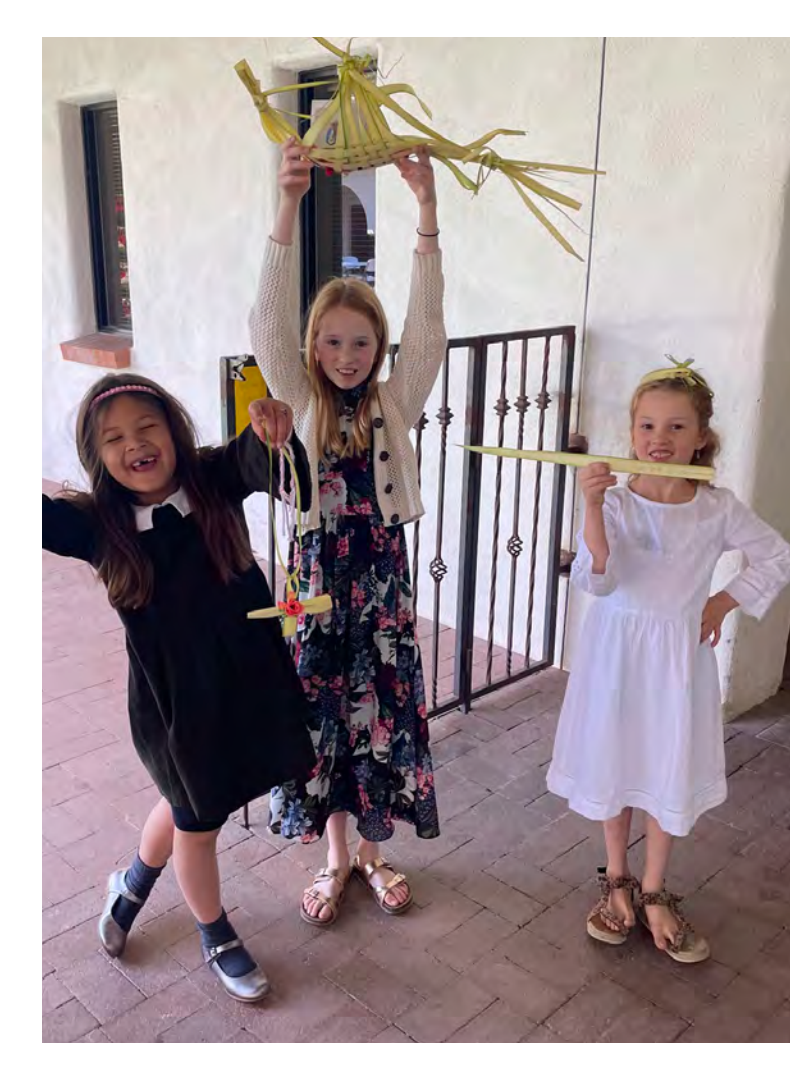
TOP LEFT, clockwise : Saint Philip's members; Children celebrating Palm Sunday; Parents' Formation Group members; Food Pantry in action.