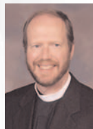
Bishop Kirk Smith Diocese of Arizona November 2004

Copies of Arizona-specific Living Wills are available in the church office.